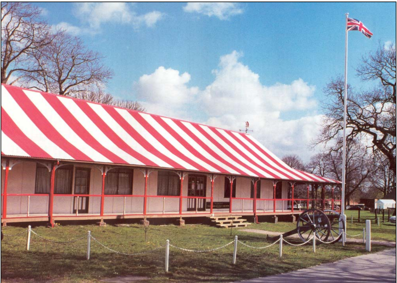
MLAGB Clubhouse, The Exhibition Hut, Bisley Camp

11-17 September 2005 National Shooting Centre Bisley Camp, Brookwood, Surrey, Great Britain